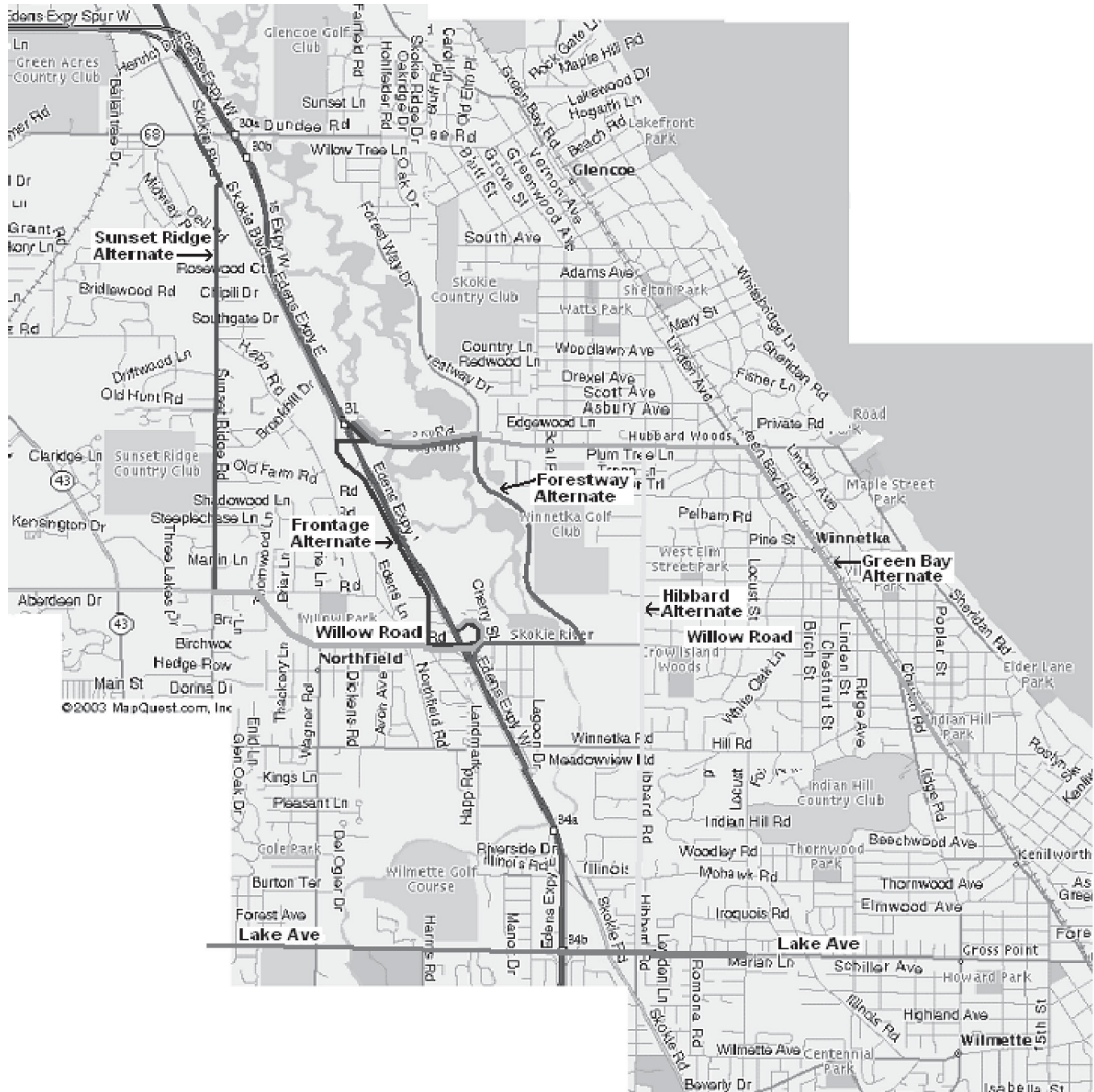
FIGURE 2 Alternate route map.

by the incident and the resulting traffic diversions. They are highlighted in Figure 2 as part of an alternate route or as a major arterial perpendicular to the expressway. Alternate routes were identified as the major parallel routes closest to the expressway and were added to the indirectly impacted zone until an uncongested route was found in the worst-case incident scenario, three lanes closed for 3 hours. Characteristics of the links, such as length, number of lanes, and the routes to which they are assigned, are presented in Table 1. Some links are a part of more than one route but were not double counted when congestion was measured. Within the indirectly impacted zone is the directly impacted zone, defined as the expressway itself, the north-bound Edens Expressway from Oakton Street on the south to Dundee